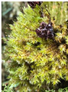
Acroporium pungens Sematophyllaceae