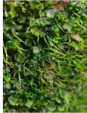
Nothoceros vincentianus Dendrocerotaceae

Las briofitas son plantas pequeñas que incluyen los antoceros, hepáticas y musgos.