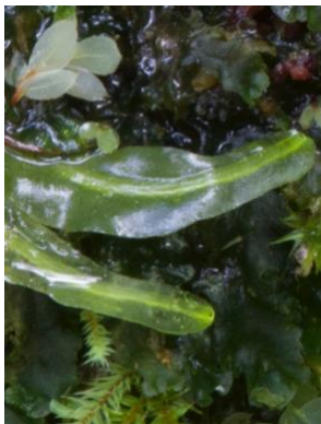
Pallavicinia lyellii Pallaviciniaceae