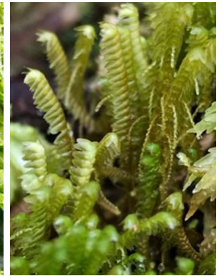
Bazzania hookeri Lepidoziaceae