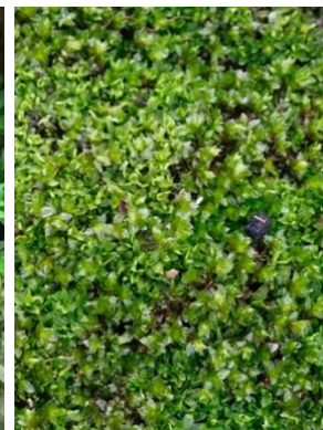
Hyophiladelphus agrarius Pottiaceae