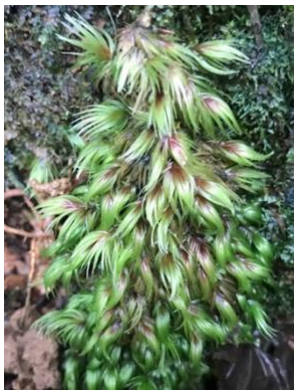
Leucobryum martianum Leucobryaceae