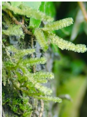
Neckeropsis undulata Neckeraceae