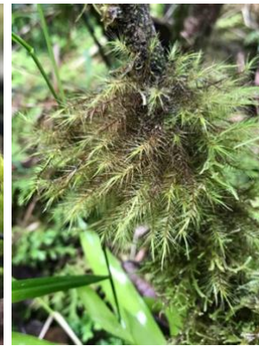
Leucoloma serrulatum Dicranaceae