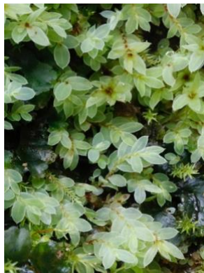
Epipterygium orbifolium Mniaceae