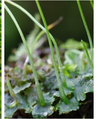
Phaeoceros carolinianus Notothyladaceae