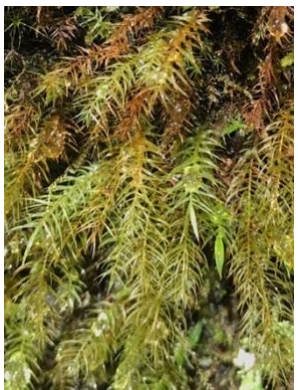
Pyrrhobryum spiniforme Rhizogoniaceae