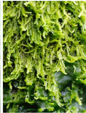
Lejeunea cerina Lejeuneaceae