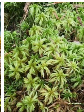
Sphagnum portoricense Sphagnaceae