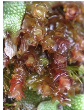
Scapania portoricensis Scapaniaceae