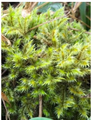
Hemiragis aurea Pilotrichaceae