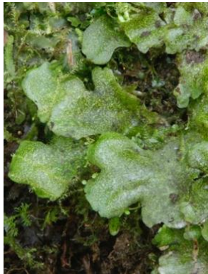
Monoclea gottschei Monocleaceae