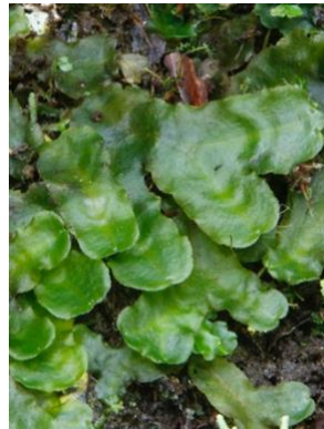
Dumortiera hirsuta Marchantiaceae