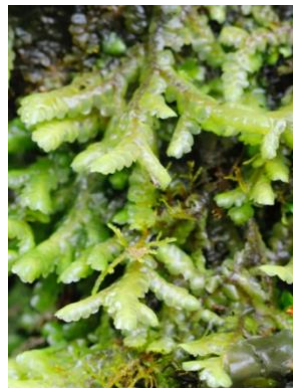
Radula paganii Radulaceae