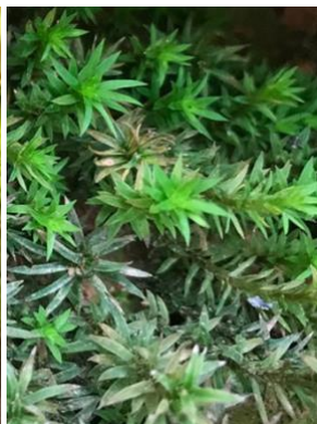
Pogonatum tortile Polytrichaceae