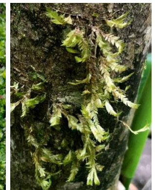
Phyllogonium viride Phyllogoniaceae