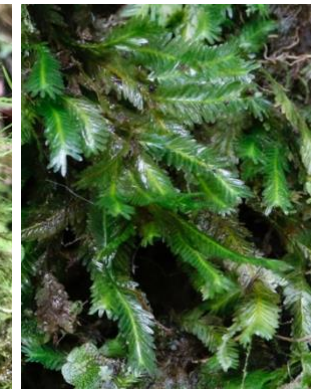
Fissidens polypodioides Fissidentaceae