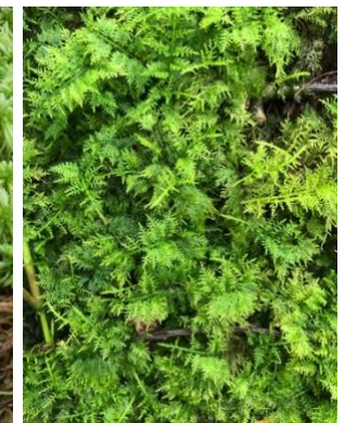
Thuidium urceolatum Thuidiaceae