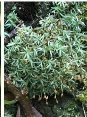
Octoblepharum albidum Octoblepharaceae