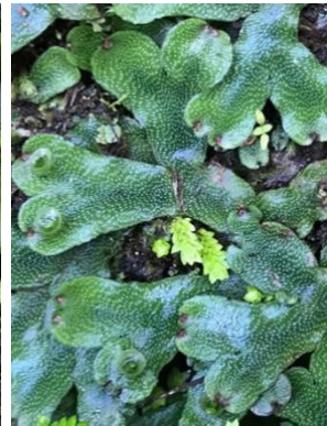
Marchantia chenopoda Marchantiaceae