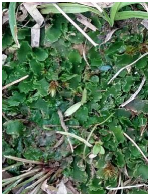
Aneura pinguis Aneuraceae