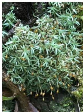
Octoblepharum albidum Octoblepharaceae