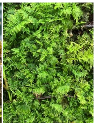
Thuidium urceolatum Thuidiaceae