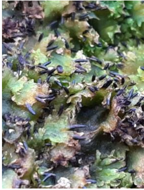
Notothylas breutelii Notothyladaceae

USDA is an equal opportunity provider, employer, and lender.