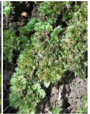
Fissidens steerei Fissidentaceae