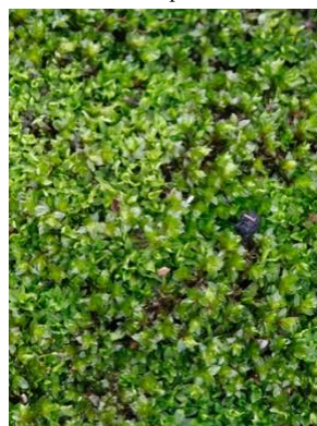
Hyophiladelphus agrarius Pottiaceae