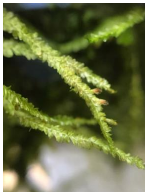
Neckeropsis disticha Neckeraceae