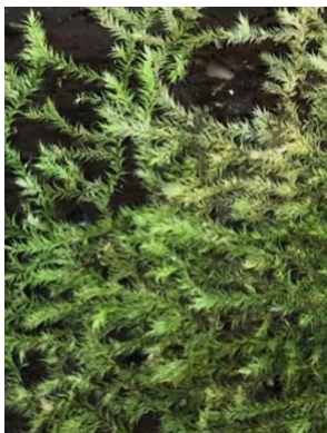
Leucomium strumosum Leucomiaceae