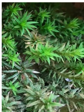
Pogonatum tortile Polytrichaceae