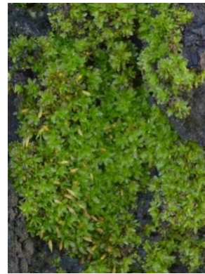
Calymperes palisotii Calymperaceae