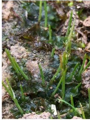
Phaeoceros carolinianus Notothyladaceae